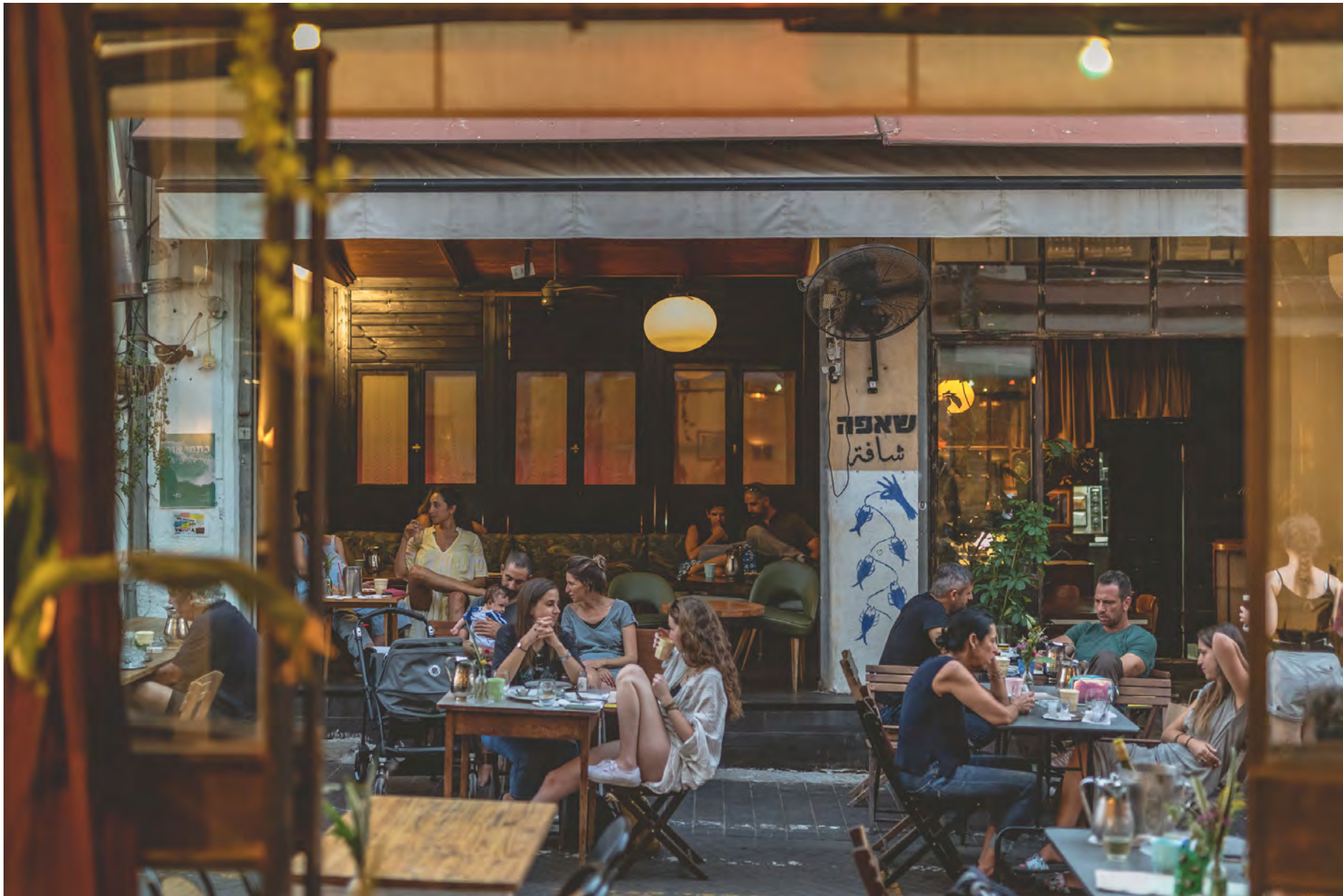
Shaffa Bar - Nakhman Street 2, Jaffa