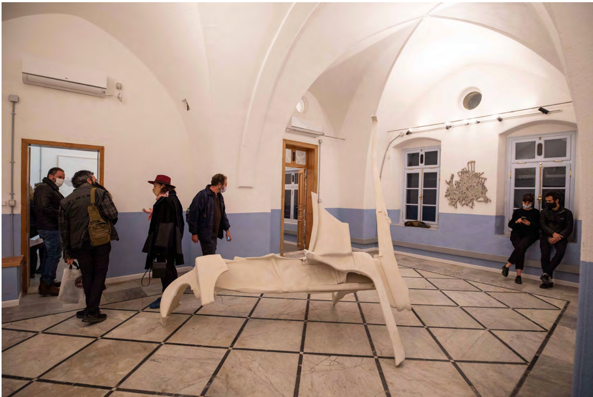
Chelouche Gallery - Mazal Te'omim Street 4, Jaffa