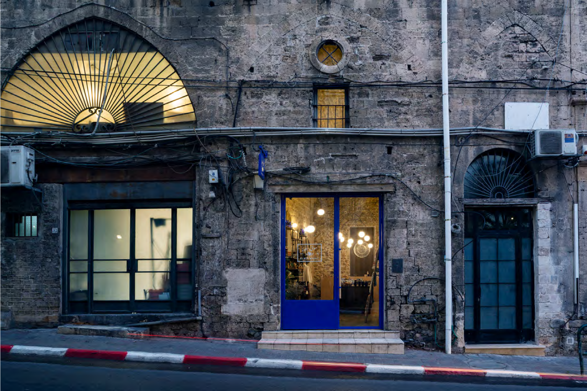
Hilweh Market - Yefet Street 32, Jaffa