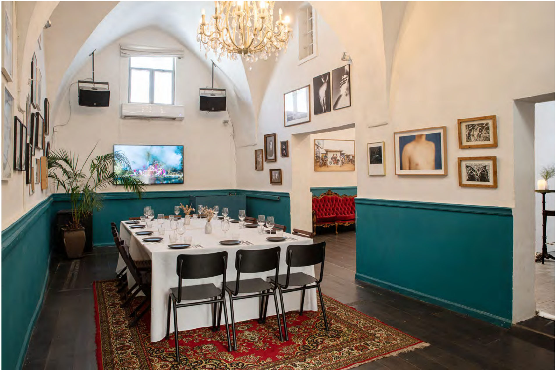
Beit Kandino - HaTsorfim Street 14, Jaffa