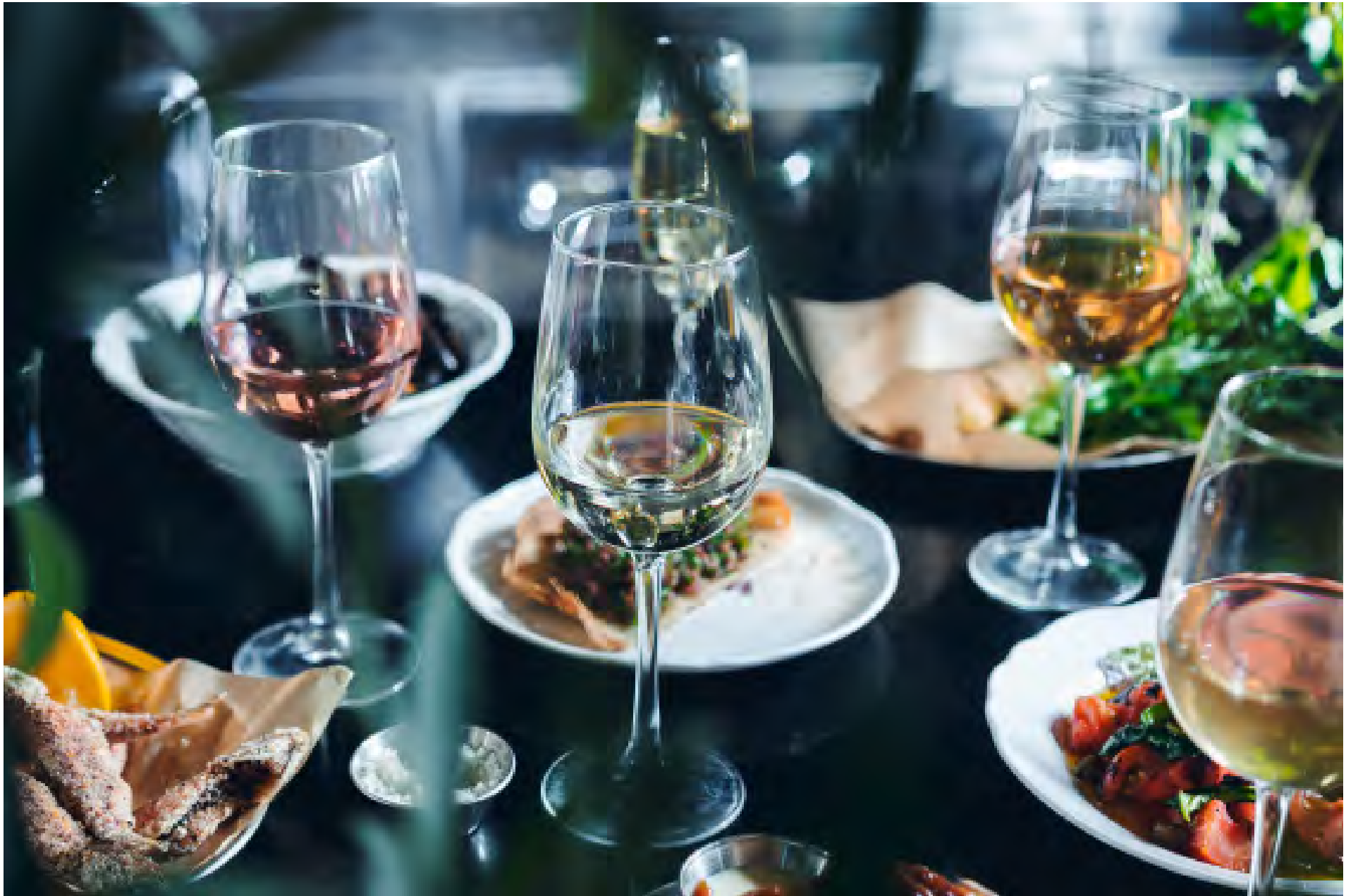
Cantina San Remo - Nehama Street 1, Jaffa