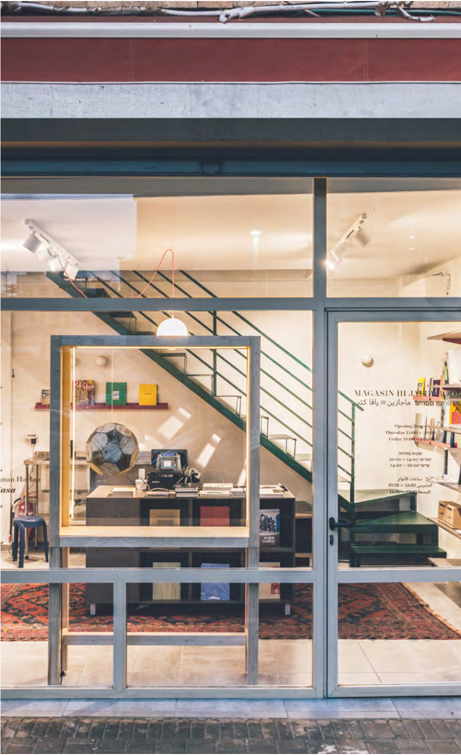
Magasin III Jaffa - Olei Zion Street 34, Jaffa