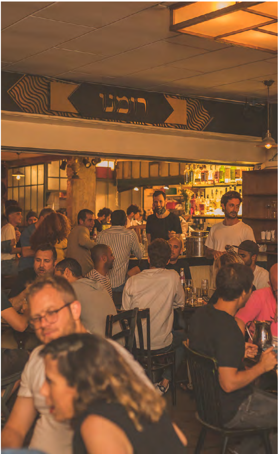
Romano - Jaffa Street 9, Tel Aviv